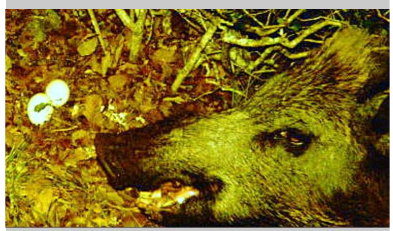
Wild pigs are known to opportunistically consume the eggs of ground nesting birds such as quail and turkeys.

The explosion of wild pig populations and decline of quail in recent years has led some to speculate whether the two occurrences are related. While research about the quail decline is ongoing, wild pigs do not actively hunt for quail eggs, or for any other game species. The majority of the diet of a typical wild pig is vegetative matter, such as grasses, forbs, roots, tubers, crops, and prickly pear<sup>1</sup>. Wild pigs are considered "opportunistic omnivores," meaning that they will eat either plants or animals that are readily available. Oftentimes, mast crops such as acorns or crops such as corn are the most readily available food source for wild pigs. But when a wild pig encounters a newborn fawn, or some quail eggs, those can be an easy meal. So, while the diet of wild pigs is mostly vegetative material, they will certainly also eat animals when given the opportunity.