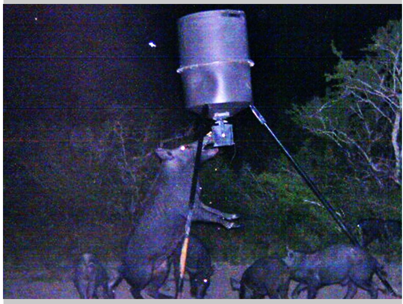
Wild pigs compete directly with native wildlife for access to resources such as supplemental feed sites.

Wild pigs interact more directly with white-tailed deer. Landowners who put out feeders for deer often find that much of the corn is consumed by wild pigs, which can also be aggressive towards deer. Another issue is the potential for disease transmission between these two mammals.