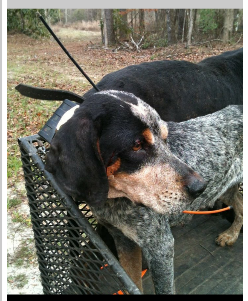
Research shows that trained dogs are often best used last after all other control techniques have been implemented and wild pig populations are already significantly reduced.